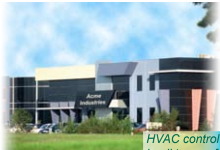
HVAC control in all types of buildings

DDC Controller features on each of 8 Plant 4 Heat, 4 Cooling stages with programmable delays, analogue heat and cool control, fan speed control, full 265 day time clock function, local over-ride for after hours operation, economising and setback function + much more!