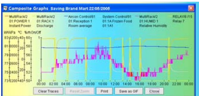
Composite graphs allow comparison of different parameters